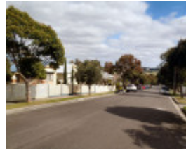
Hoffman Street Brunswick (1) Hoffman Street Brunswick (2)