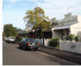
Lyle St Brunswick