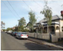
Cliff St Brunswick