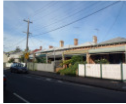
Percy St Brunswick