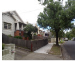
Marion Ave Brunswick West (1)