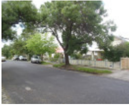
Marion Ave Brunswick West (2)