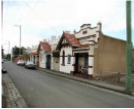
Gray St looking N