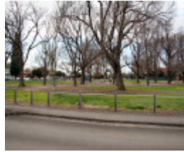
Temple Park from Gray St