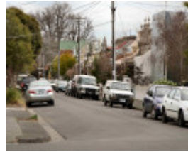
Wilson St looking W