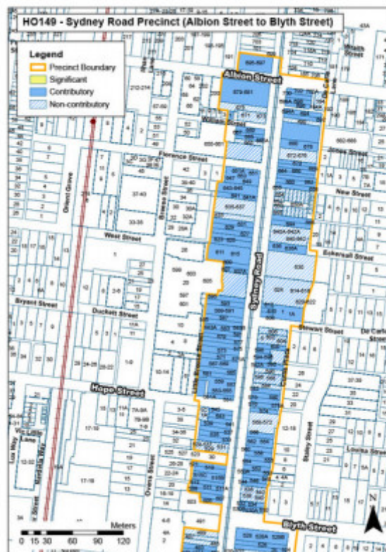
Sydney Road Precinct Map (Albion Street to Blyth Street)