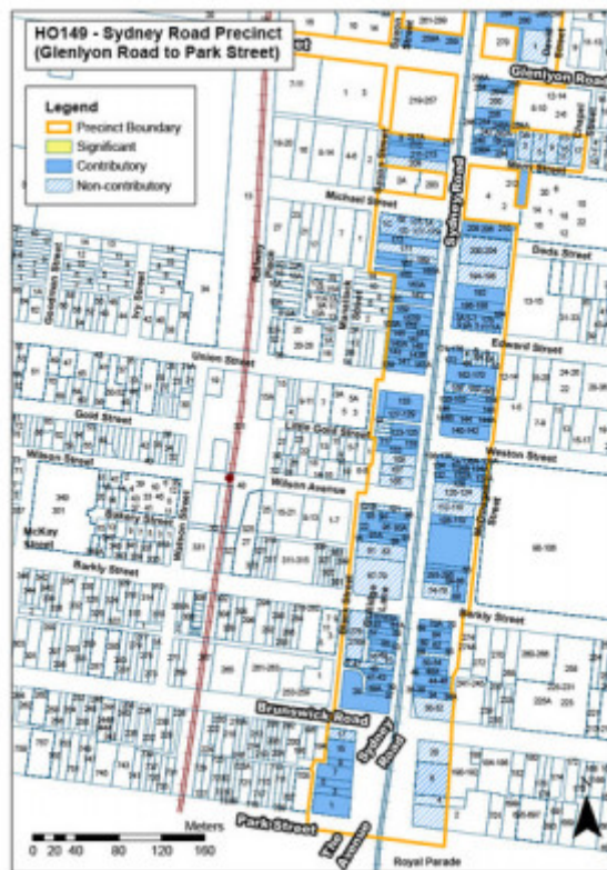
Sydney Road Precinct Map (Glenlyon Road to Park Street)