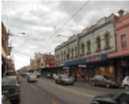
Sydney Rd looking South.jpg