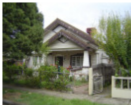
French Avenue Precinct