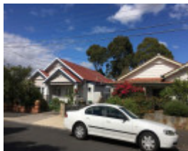
Hickford Street Precinct