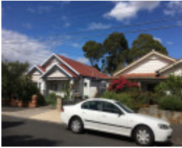
Hickford Street Precinct