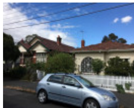
Hickford Street Precinct