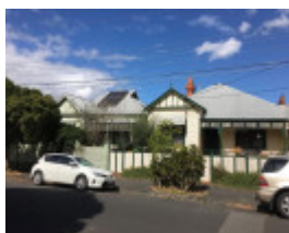
Hickford Street Precinct