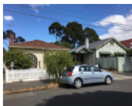
Hickford Street Precinct