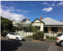
Hickford Street Precinct