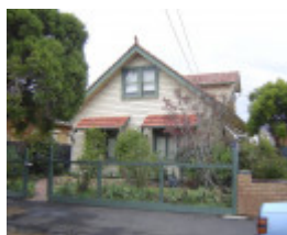
Hickford Street Precinct