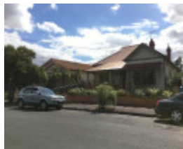
Hickford Street Precinct