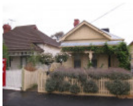
Warburton Street Precinct