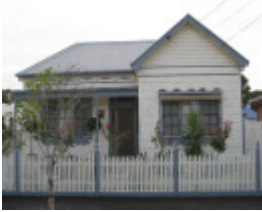
Allan Street Precinct