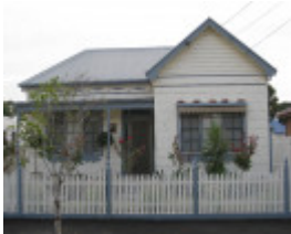
Allan Street Precinct