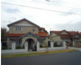
Sumner Estate Precinct