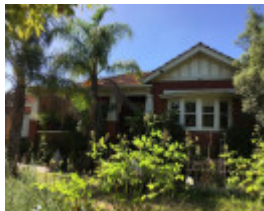
Waxman Parade Precinct - No.10