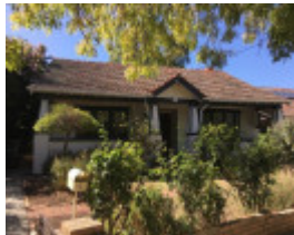
Waxman Parade Precinct - No.4