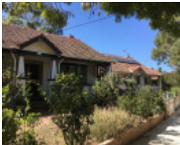
Waxman Parade Precinct