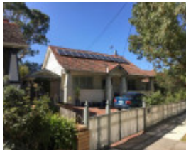
Waxman Parade Precinct - No.6