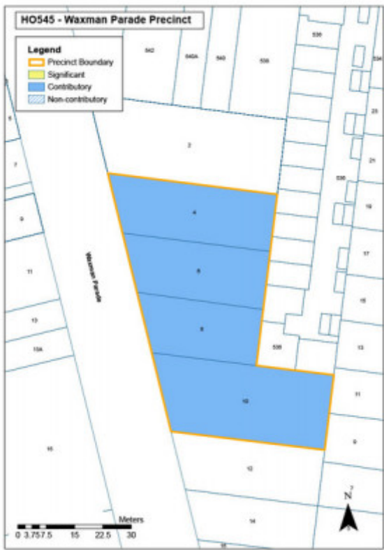
Waxman Parade Precinct Map