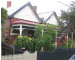
Victoria Street Precinct