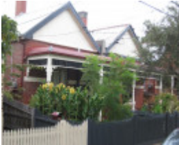
Victoria Street Precinct