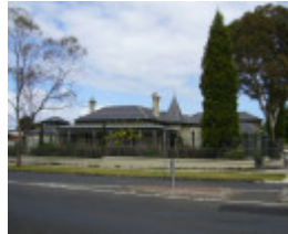
The Grove (2)