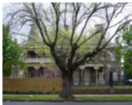
The Grove (1)