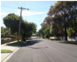
The Grove (2)