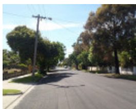
The Grove (2)