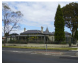
The Grove (2)