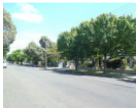
The Grove (4)