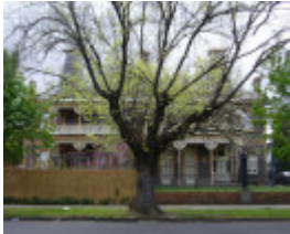
The Grove (1)