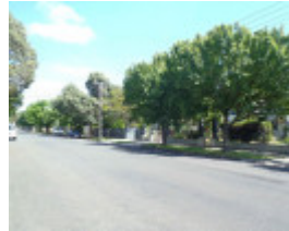
The Grove (4)