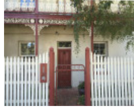
195 Barkly St Brunswick