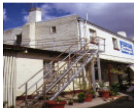
guildford hotel music hall & stables midland hwy guildford rear view of hotel