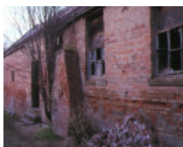
guildford hotel music hall & stables midland hwy guildford side view of music hall