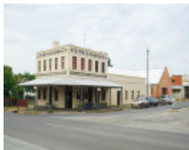
GUILDFORD HOTEL MUSIC HALL AND STABLES SOHE 2008