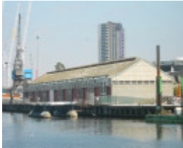
BERTH NO. 5 NORTH WHARF SOHE 2008