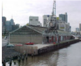
1 berth 5 north wharf jun01 pm1