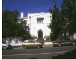
1 residence wallace avenue toorak front view feb1999