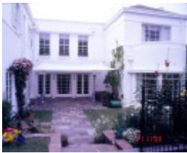
h01806 wallace avenue toorak rear she project 2004