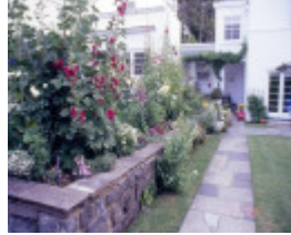
h01806 wallace avenue toorak garden she project 2004