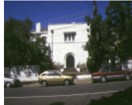
1 residence wallace avenue toorak front view feb1999