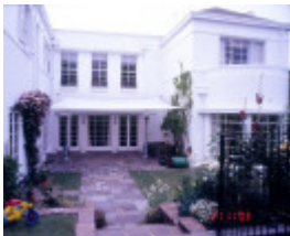
h01806 wallace avenue toorak rear she project 2004