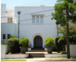
RESIDENCE SOHE 2008