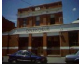
FORMER CARLTON CRECHE SOHE 2008 1 carlton creche fo nov1999