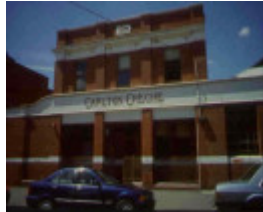
1 carlton creche fo nov1999