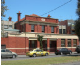
FORMER CARLTON CRECHE SOHE 2008