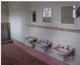
h01835 block 19 bonegilla amenities 5 pm1 jun03