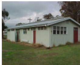
h01835 block 19 bonegilla amenities 6 pm1 jun03