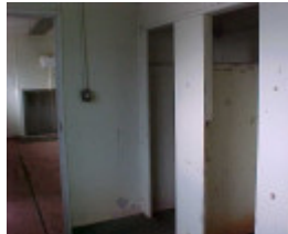
h01835 block 19 bonegilla amenities 4 pm1 jun03