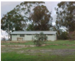
h01835 block 19 bonegilla view up slope to amenities pm1 jun03