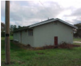
h01835 block 19 bonegilla amenities 2 pm1 jun03