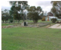
h01835 block 19 bonegilla amenities building pads pm1 jun03