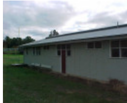
h01835 block 19 bonegilla amenities 1 pm1 jun03