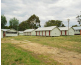
BLOCK 19 SOHE 2008