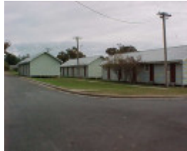
1 bonegilla migrant camp accommodation huts