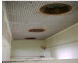
h01835 block 19 bonegilla amenities 3 pm1 jun03