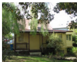
FORMER INVERGOWRIE LODGE NORTH ELEVATION