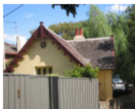
FORMER INVERGOWRIE LODGE SOUTH ELEVATION