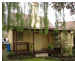
H0517 facade from Burwood Road