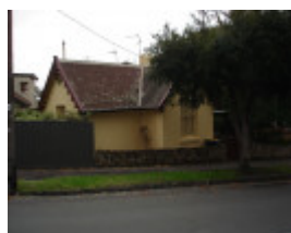
H0517 View from Coppin Grove