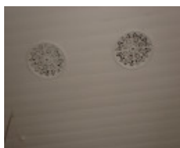
State school 2828 ventilators in ceiling KJ 26 Jul 07