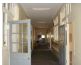
State school 2828 interior KJ 26 Jul 07