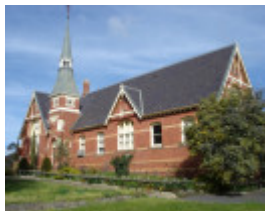
State school 2828 Maryborough