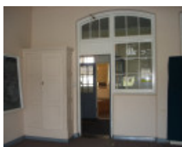
State school 2828 interior KJ 26 Jul 07