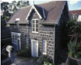
the Hawthorns Hawthorn former stables jun1978