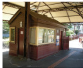
Small building under the northern end of the Platform 2 and 3 canopy