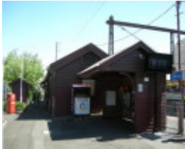
Northern ends of east [Platform 1] buildings viewed from the Evansdale Rd footpath