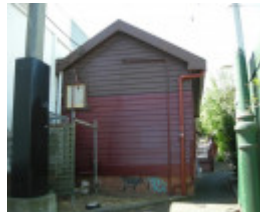
Platform 1 building - southwest elevation