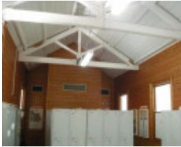
Looking north-east within the Burwood Rd end of the Platform 1 building - the king-post roof trusses about those of the platform canopy outside the wall to the left