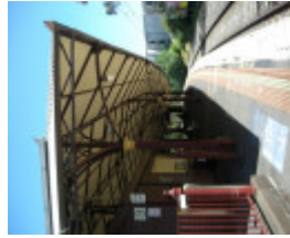
Looking from the north along the edge of Platform 3 - the matching curvature of the canopy roof and platform edge is evident