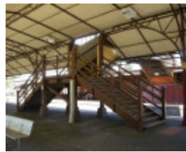
Access stairs to footbridge viewed from the southwest - from beneath the Platform 2 and 3 canopy