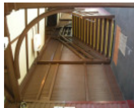
Platform 1 - base of stairs to the overbridge