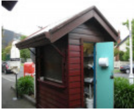
Small standalone building between Platform 1 building and Evansdale Rd