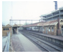
hawthorn railway station end view