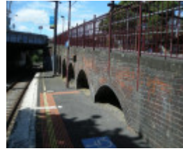
Looking north along Platform 3 at the west-facing brick wall beneath the walkway