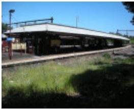
Looking at Platform 3 from the north, with the entire Platform 2 and 3 canopy visible