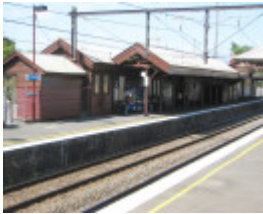
HAWTHORN RAILWAY STATION COMPLEX SOHE 2008