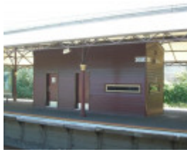
This building under the southern end of the Platform 2 and 3 canopy was constructed in 2014 and contains facilities for Protective Services Officers