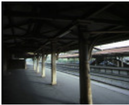
hawthorn railway station platform detail