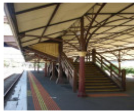
The roofed footbridge and its access stairs links the two Platforms at their mid-points