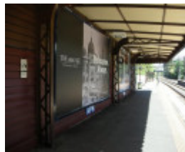
Looking south beneath the Platform 1 cantilever-truss canopy