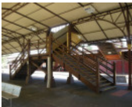
Access stairs to footbridge viewed from the southwest - from beneath the Platform 2 and 3 canopy