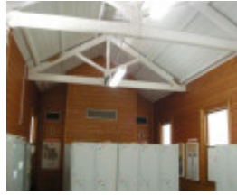
Looking north-east within the Burwood Rd end of the Platform 1 building - the king-post roof trusses about those of the platform canopy outside the wall to the left