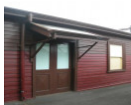
Platform 1 building - glazed timber doors and awning within the southeast-facing elevation