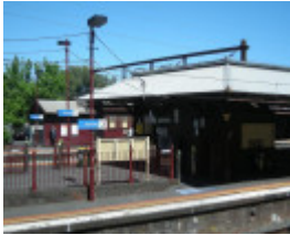
Looking from the west at the northern ends of the buildings and canopies on Platforms 1, 2 and 3