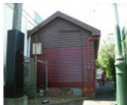
Platform 1 building - southwest elevation