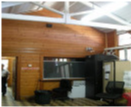
Looking south-west within the Burwood Rd end of the Platform 1 building