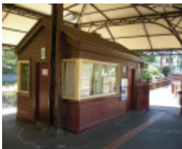
Small building under the northern end of the Platform 2 and 3 canopy