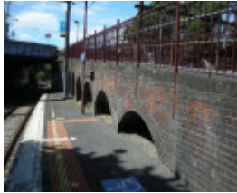
Looking north along Platform 3 at the west-facing brick wall beneath the walkway