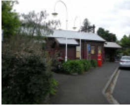
Platform 1-side buildings viewed from the south on Evansdale Rd