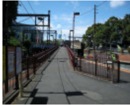
Looking north and upwards along the pedestrian walkway which links the island Platforms 2 and 3 with the south-side footpath on Burwood Rd bridge