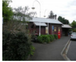
Platform 1-side buildings viewed from the south on Evansdale Rd