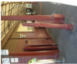
Painted cast iron and timber fence and gate components beneath the northern end of the Platform 2 and 3 canopy