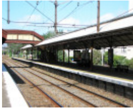
HAWTHORN RAILWAY STATION COMPLEX SOHE 2008