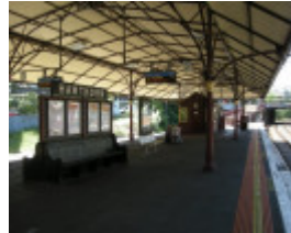
Looking north from the mid-point of the edge of Platform 2 - the Station nameboard and back-to-back timber benches in foreground are significant elements