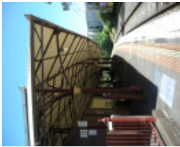
Looking from the north along the edge of Platform 3 - the matching curvature of the canopy roof and platform edge is evident