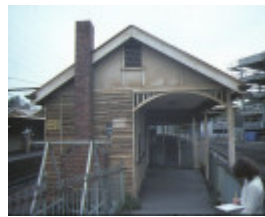
hawthorn railway station centre platform entrance