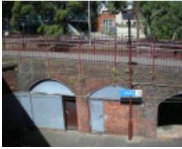
The northern-most of the arched alcoves beneath the pedestrian walkway have been enclosed to create storage areas