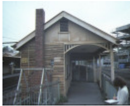
hawthorn railway station centre platform entrance