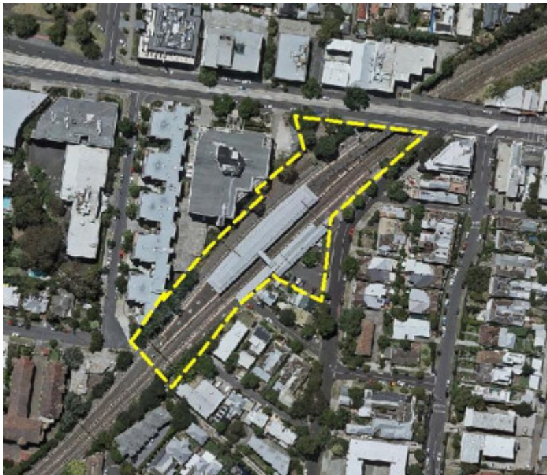
Aerial photo of Hawthorn Railway Station Complex showing Registration extent