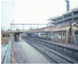
hawthorn railway station end view