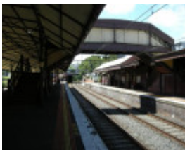
Looking northwards along the edge of Platform 2 with the south elevation of the roofed footbridge between the Platforms visible at upper right