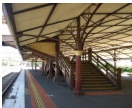
The roofed footbridge and its access stairs links the two Platforms at their mid-points