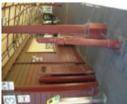
Painted cast iron and timber fence and gate components beneath the northern end of the Platform 2 and 3 canopy