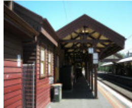
Looking southward along Platform 1 at its buildings and canopy - the canopy timber king-post trusses and support brackets of bent rail are visible