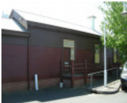
Southeast elevation of the Platform 1 building viewed from the carparking area