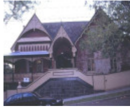
h00552 1 alloarmo grattan st hawthorn external front view she project 2003