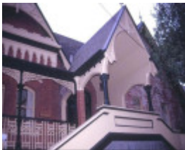
alloarmo grattan st hawthorn front gables she project 2003