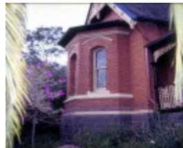
alloarmo grattan st hawthorn bay window she project 2003