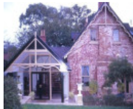
alloarmo grattan st hawthorn rear view she project 2003