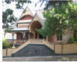
ALLOARMO SOHE 2008