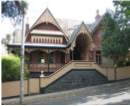
ALLOARMO SOHE 2008