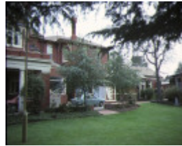
immigration reception centre hawthorn rear garden jun1984