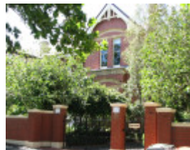
SHENTON SOHE 2008