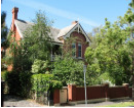
SHENTON SOHE 2008