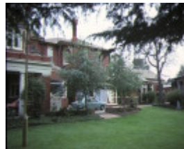
immigration reception centre hawthorn rear garden jun1984