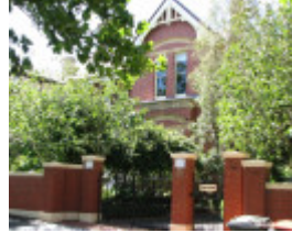
SHENTON SOHE 2008