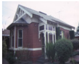
immigration reception centre hawthorn side view