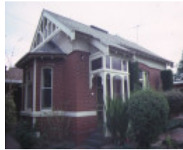
immigration reception centre hawthorn side view