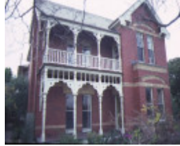
1 immigration reception centre hawthorn front view jun1984