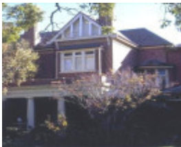
h00788 shenton kinkora rd hawthorn rear view