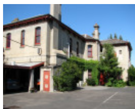
KAWARAU SOHE 2008