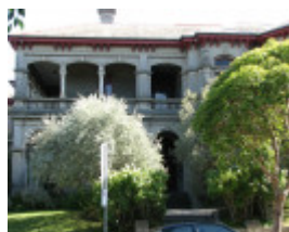
KAWARAU SOHE 2008