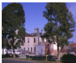
1 kawarau hawthorn rear view