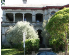
KAWARAU SOHE 2008