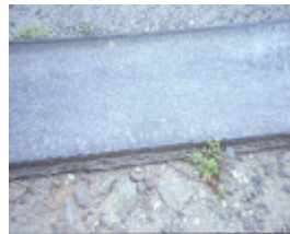
market gardeners tram plateway centre dandenong road heatherton top view of plateway 1992