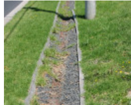
MARKET GARDENERS TRAM PLATEWAY SOHE 2008