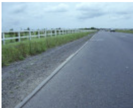
1 market gardeners tram plateway centre dandenong road heatherton front view of road