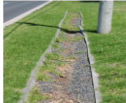
MARKET GARDENERS TRAM PLATEWAY SOHE 2008