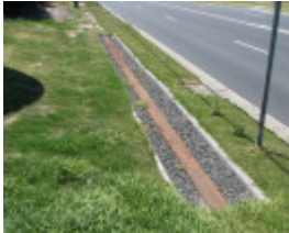
MARKET GARDENERS TRAM PLATEWAY SOHE 2008