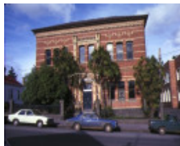
1 former ballarat east free library front elevation jul1982