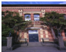
former ballarat east free library entrance detail jul1982