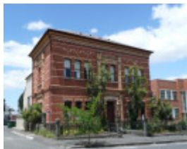
FORMER BALLARAT EAST FREE LIBRARY SOHE 2008