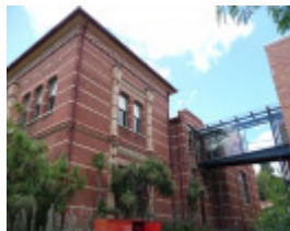
FORMER BALLARAT EAST FREE LIBRARY SOHE 2008