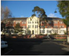
University High School_Parkville_KJ_9/7/08