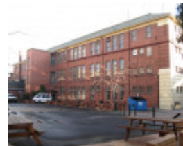
University High_parkville_rear elevation_Kj_9/7/08