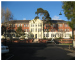
University High School_Parkville_KJ_9/7/08