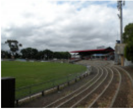
Bridges Reserve and City Oval