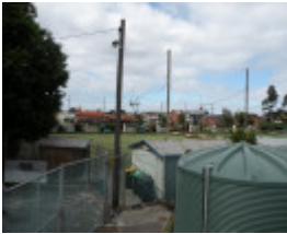
Bridges Reserve and City Oval