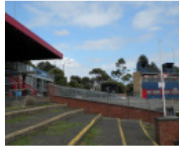
Bridges Reserve and City Oval