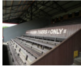
Bridges Reserve and City Oval