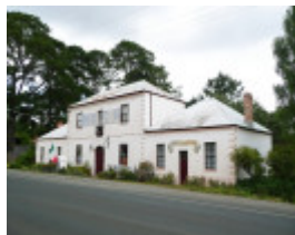
FORMER MACARONI FACTORY SOHE 2008