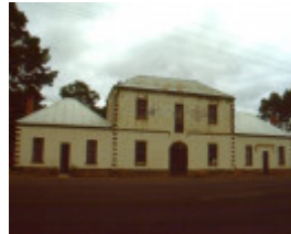
h407 macaroni factory march 2001