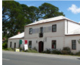
FORMER MACARONI FACTORY SOHE 2008