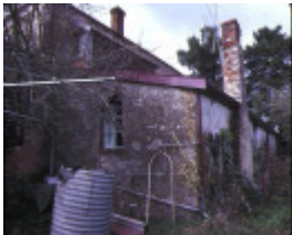
former macaroni factory main rd hepburn springs rear view sep1981