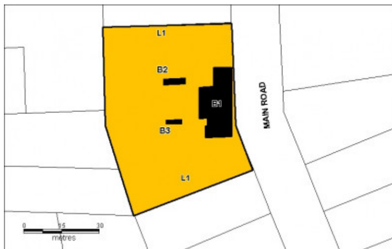
former macaroni factory h407 extent april 2001