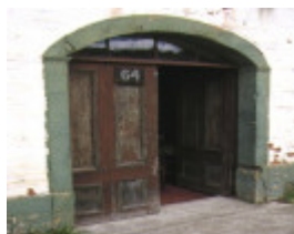
former macaroni factory main rd hepburn springs entrance jan1994