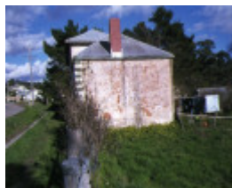
former macaroni factory main rd hepburn springs side view