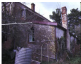
former macaroni factory main rd hepburn springs rear view sep1981