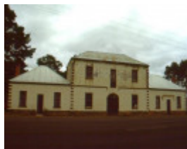
h407 macaroni factory march 2001