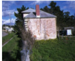
former macaroni factory main rd hepburn springs side view