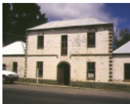
former macaroni factory main road hepburn springs front elevation