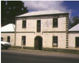
former macaroni factory main road hepburn springs front elevation