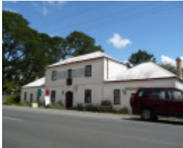
FORMER MACARONI FACTORY SOHE 2008