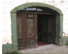
former macaroni factory main rd hepburn springs entrance jan1994