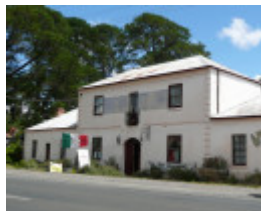
FORMER MACARONI FACTORY SOHE 2008