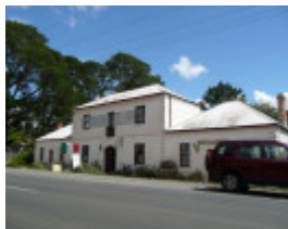
FORMER MACARONI FACTORY SOHE 2008