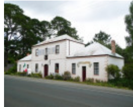
FORMER MACARONI FACTORY SOHE 2008