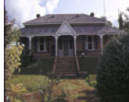
1 hopetoun house evenyl crescent hopetoun front view sep1992