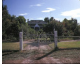
hopetoun house evelyn crescent hopetoun front gates apr1989