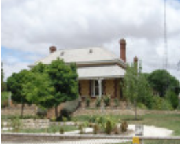
HOPETOUN HOUSE SOHE 2008