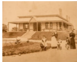
Hopetoun House c1891.jpg