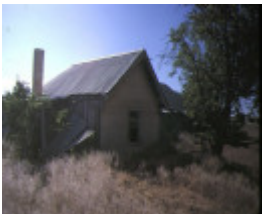
hopetoun house evelyn crescent hopetoun slab hut jan1985