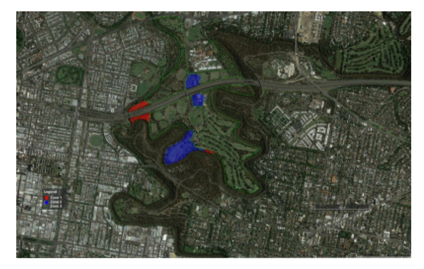
Yarra Bend Park Permit Exemption Zones Guidance