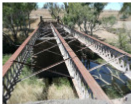
GLENMONA BRIDGE SOHE 2008