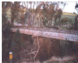
1 glenmona river bridge ntv