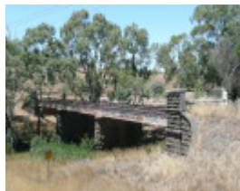
GLENMONA BRIDGE SOHE 2008