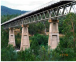
1 mckillops bridge ntv1996