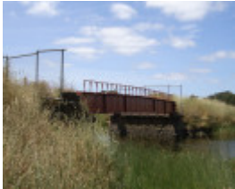
HOTSPUR BRIDGE SOHE 2008