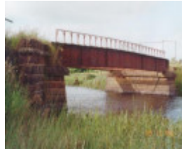
1 hotspur bridge ntv