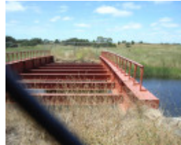
HOTSPUR BRIDGE SOHE 2008