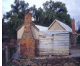
h01838 tutes cottage greenhill road castlemaine chimney she project 2003