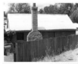
h01838 tutes cottage castlemaine johncollins1976