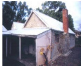
h01838 tutes cottage greenhill road castlemaine verandah she project 2003