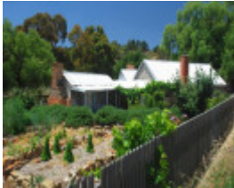
TUTE'S COTTAGE (FORMERLY HANNAN'S) SOHE 2008