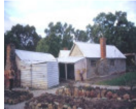
h01838 1 tutes cottage greenhill road castlemaine front elevation she project 2003