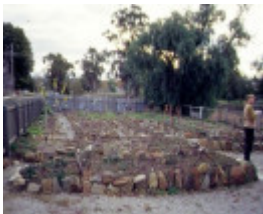
h01838 tutes cottage greenhill road castlemaine garden she project 2003