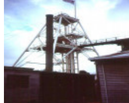
CENTRAL DEBORAH GOLD MINE SOHE 2008 1 central deborah gold db june1999