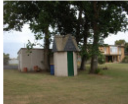
ST STEPHENS CHURCH AND SCHOOL SOHE 2008