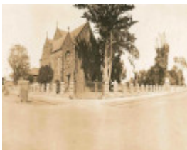
St Stephens from GSC collection00002.jpg