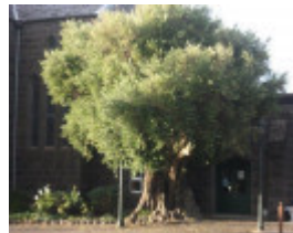
Olive Tree At St Stephens Believed to be planted in 1881.