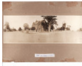
St Stephens Church-Portland.jpg