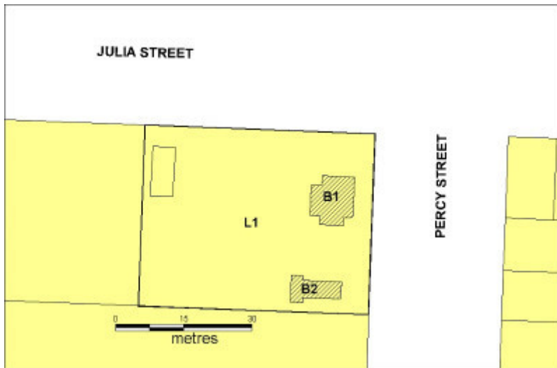
st stephens church and school portland plan