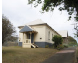
ST STEPHENS CHURCH AND SCHOOL SOHE 2008