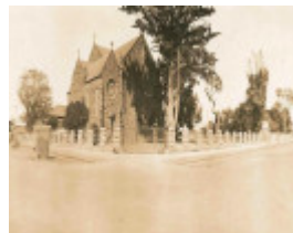
St Stephens from GSC collection00002 c1920s-30s.jpg