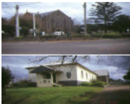
1 st stephens church and school portland