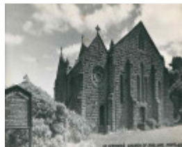
St Stephens from GSC collection00003 c1923-48.jpg