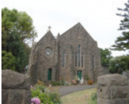
ST STEPHENS CHURCH AND SCHOOL SOHE 2008