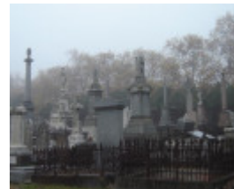
h00049 boroondara cemetery