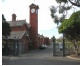
h00049 boroondara cemetery jh june 2005 036