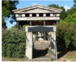
BOROONDARA GENERAL CEMETERY SOHE 2008