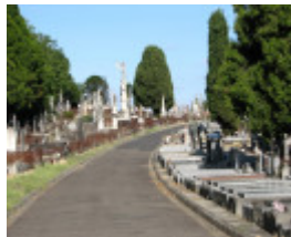
BOROONDARA GENERAL CEMETERY SOHE 2008