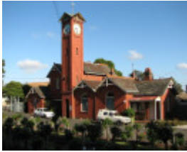
BOROONDARA GENERAL CEMETERY SOHE 2008