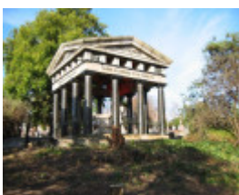
h00049 boroondara cemetery jh june 2005 003