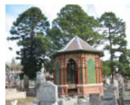
h00049 boroondara cemetery_rotunda_jh june 2005 014