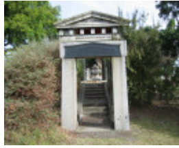
h00049 boroondara cemetery jh june 2005 029