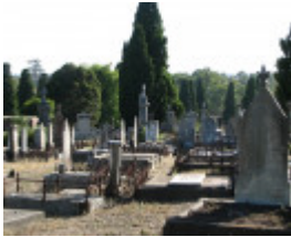
BOROONDARA GENERAL CEMETERY SOHE 2008