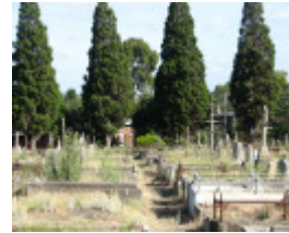
BOROONDARA GENERAL CEMETERY SOHE 2008