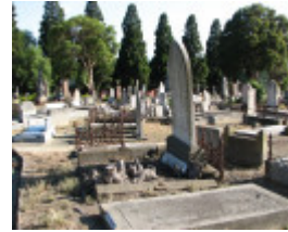
BOROONDARA GENERAL CEMETERY SOHE 2008