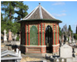
BOROONDARA GENERAL CEMETERY SOHE 2008