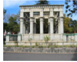
h00049 boroondara cemetery jh june 2005 031