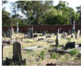
BOROONDARA GENERAL CEMETERY SOHE 2008