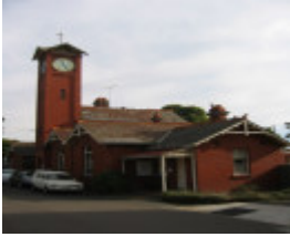
h00049 boroondara cemetery jh june 2005 034