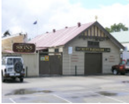
BLUNTS BOATYARD AND SLIPWAY SOHE 2008