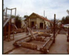
1 blunts boatyard slipway traverser & shed