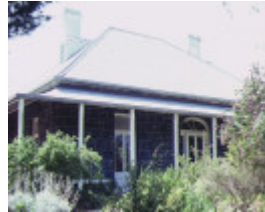
1 strathtulloh homestead melton south front view of homestead