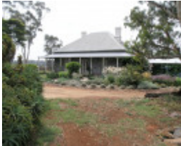
STRATHTULLOH SOHE 2008