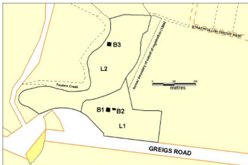
strathtulloh plan 2000