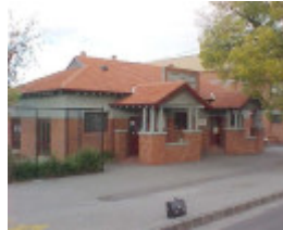
h02042 h2042 baby health care centre coburg 2003