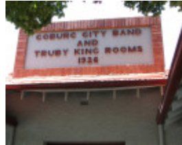
BABY HEALTH CARE CENTRE SOHE 2008