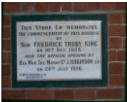
h02042 h2042 baby health care centre coburg foundation stone 2001