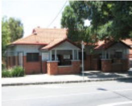
BABY HEALTH CARE CENTRE SOHE 2008