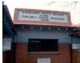
h02042 h2042 baby health care centre coburg plaque 2001