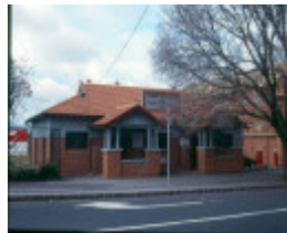
Baby Health Care Centre Coburg 2001