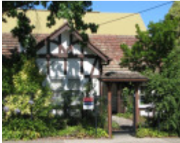
MATERNAL AND CHILD HEALTH CENTRE SOHE 2008