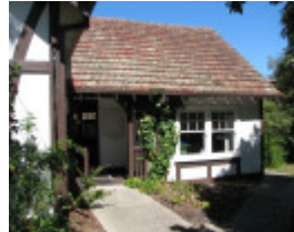
MATERNAL AND CHILD HEALTH CENTRE SOHE 2008