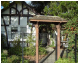
h00054 croydon maternal health centre may05 lych gate2