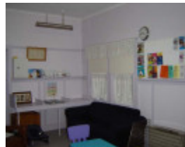
h00054 croydon maternal health centre may05 main room