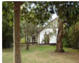
h00054 croydon maternal health centre may05 north side3