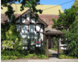
MATERNAL AND CHILD HEALTH CENTRE SOHE 2008