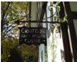
h00054 croydon maternal health centre may05 sign