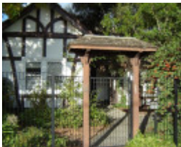
h00054 croydon maternal health centre may05 lych gate2