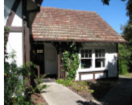
MATERNAL AND CHILD HEALTH CENTRE SOHE 2008