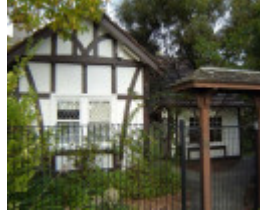
h00054 1 croydon maternal health centre may05 front