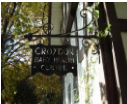
h00054 croydon maternal health centre may05 sign