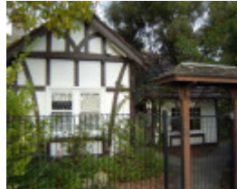
h00054 1 croydon maternal health centre may05 front