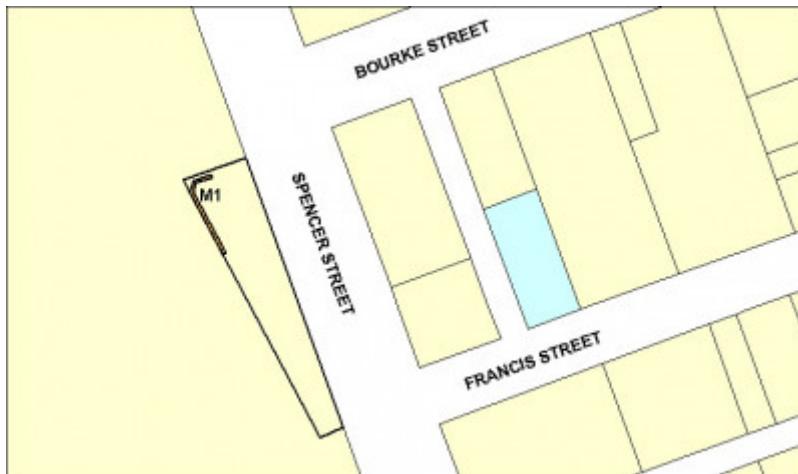
history of transport mural plan