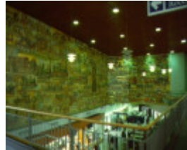
1 history of transport mural 2000