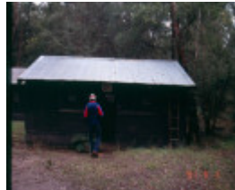
H01981 camp eureka model hut 1 2001