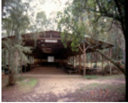
H01981 camp eureka mess 2001