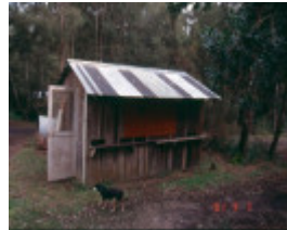
H01981 camp eureka servery 2001