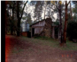
H01981 camp eureka rec hall 2001