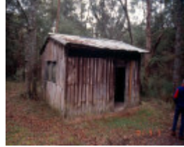
H01981 camp eureka medical hut 2001