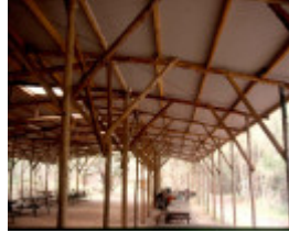
H01981 camp eureka mess interior 2001