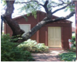
BELLHOUSE IRON HOUSE SOHE 2008