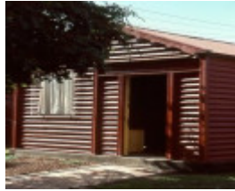
1 bellhouse iron house