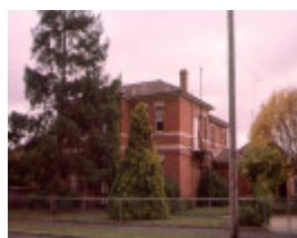
1 female refuge ballarat ac2 may00