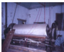
former female refuge complex scott pde ballarat mangle side view she project 2003