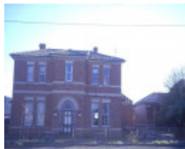
former female refuge complex scott pde ballarat east front view she project 2003