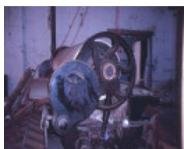
former female refuge complex scott pde ballarat mangle in laundry she project 2003