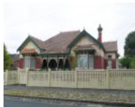
FORMER FEMALE REFUGE COMPLEX SOHE 2008