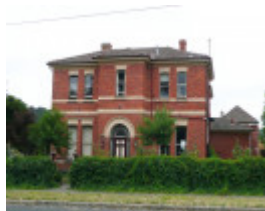
FORMER FEMALE REFUGE COMPLEX SOHE 2008