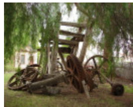
Log winch at the brothels site, relocated from the Evans Brothers Sawmill. March 2007.