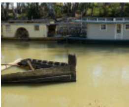
20151005_Echuca wharf Wet Dockand B22 Barge 12.JPG