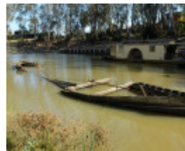
20151005_Echuca wharf Wet Dockand B22 Barge 14.JPG