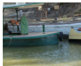
20151005_Echuca wharf Wet Dockand B22 Barge 16.JPG