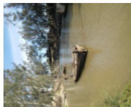
20151005_Echuca wharf Wet Dockand B22 Barge 1.jpg