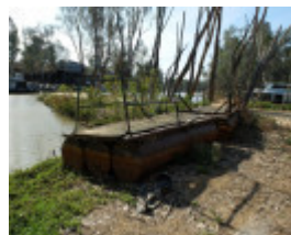
20151005_Echuca wharf Wet Dockand B22 Barge 4.JPG