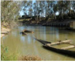
20151005_Echuca wharf Wet Dockand B22 Barge 2.JPG