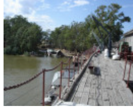
Echuca Wharf Jan 2006 mz View Along Wharf to Wet Dock