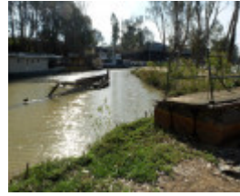
20151005_Echuca wharf Wet Dockand B22 Barge 5.JPG