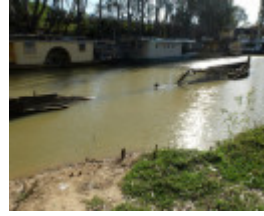
20151005_Echuca wharf Wet Dockand B22 Barge 8.JPG