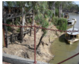
Echuca Wharf Jan 2006 mz Remnant Structure to North of Extant Wharf 01