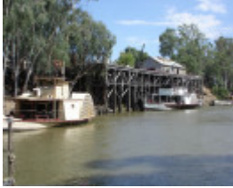
Echuca Wharf Jan 2006 mz Setting