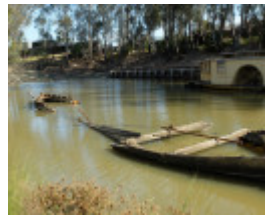
20151005_Echuca wharf Wet Dockand B22 Barge 10.JPG