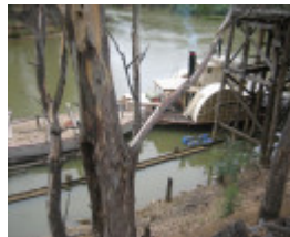
Echuca Wharf Feb 2008 mz Remnant Structure to North of Extant Wharf 02