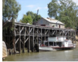
Echuca Wharf Jan 2006 mz View From Murray River