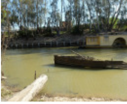
20151005_Echuca wharf Wet Dockand B22 Barge 6.JPG