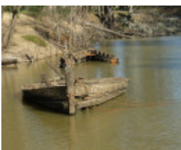
20151005_Echuca wharf Wet Dockand B22 Barge 15.JPG