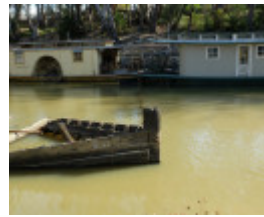
20151005_Echuca wharf Wet Dockand B22 Barge 11.JPG