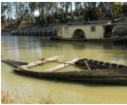
20151005_Echuca wharf Wet Dockand B22 Barge 9.JPG