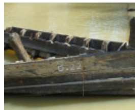
20151005_Echuca wharf Wet Dockand B22 Barge 13.JPG