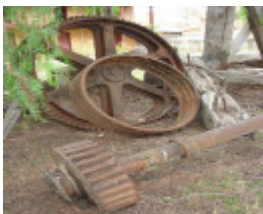
Remnant log winch mechanical parts - gears and counter shaft. March 2007.