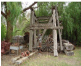
Log winch at the brothels site, relocated from the Evans Brothers Sawmill. March 2007.