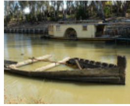
20151005_Echuca wharf Wet Dockand B22 Barge 3.JPG