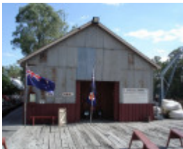
Echuca Wharf Jan 2006 mz Cargo Shed and State Border