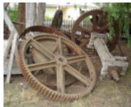
Remnant log winch mechanical parts - gears. March 2007.