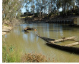
20151005_Echuca wharf Wet Dockand B22 Barge 7.JPG