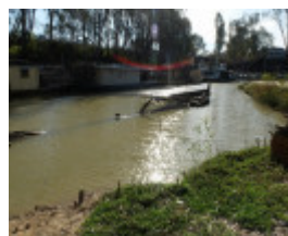
20151005_Echuca wharf Wet Dockand B22 Barge 17.JPG