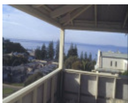
cotidental hotel ocean beach road sorrento top floor view she project 2003