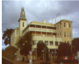
1 Continental Hotel