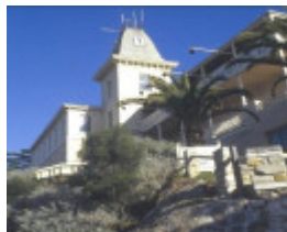
cotidental hotel ocean beach road sorrento side view she project 2003