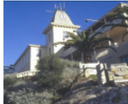
cotinental hotel ocean beach road sorrento side view she project 2003