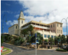
CONTINENTAL HOTEL SOHE 2008