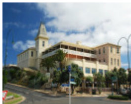
CONTINENTAL HOTEL SOHE 2008