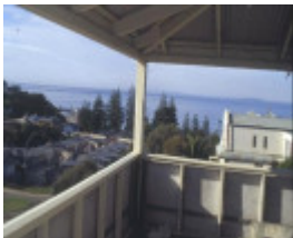
cotinental hotel ocean beach road sorrento top floor view she project 2003