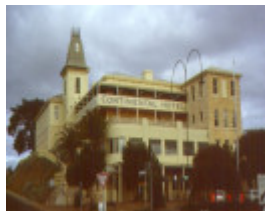
1 Continental Hotel